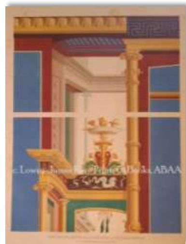
Pl. #31. Portions of a Painted Wall in the House of the Second Foundation, in the Street of Mercury at Pompeii (size of original) Fine Original Chromolithograph. Folio. (25.5 x 20 inches, 647 x 508 mm.) $1500.00