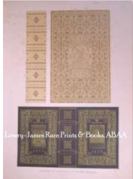
Plate #7. Specimens of Bookbinding in the 14 th Century, from the Library at the Vatican. Fine Original Chromolithograph. $1400.00 Folio. (25.5 x 20 inches, 647 x 508 mm.)