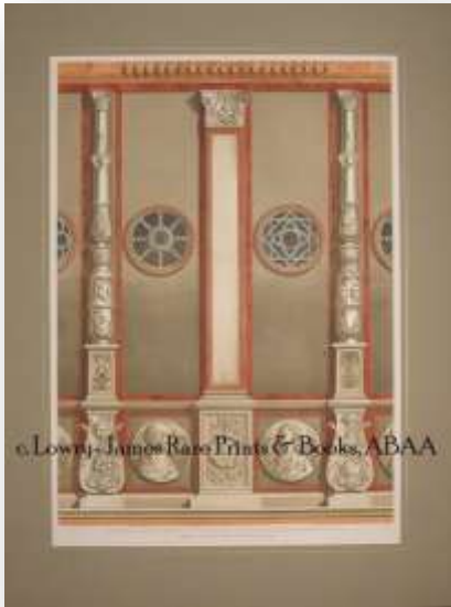
Plate #56 External Enrichment in Stone and Terra Cotta by Bramante from the Church of Sta. Maria Delle Grazie at Milan, (1492). Fine Original Chromolithograph. $1600.00 Folio. (25.5 x 20 inches, 647 x 508 mm.)